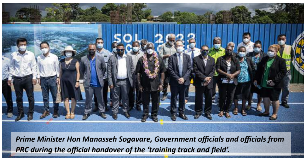
Prime Minister Hon Manasseh Sogavare, Government officials and officials from PRC during the official handover of the 'training track and field'.

The official handover took place on Friday 22nd April, 2022. Solomon Islands Prime Minister, Hon. Manasseh D. Sogavare received the brand-