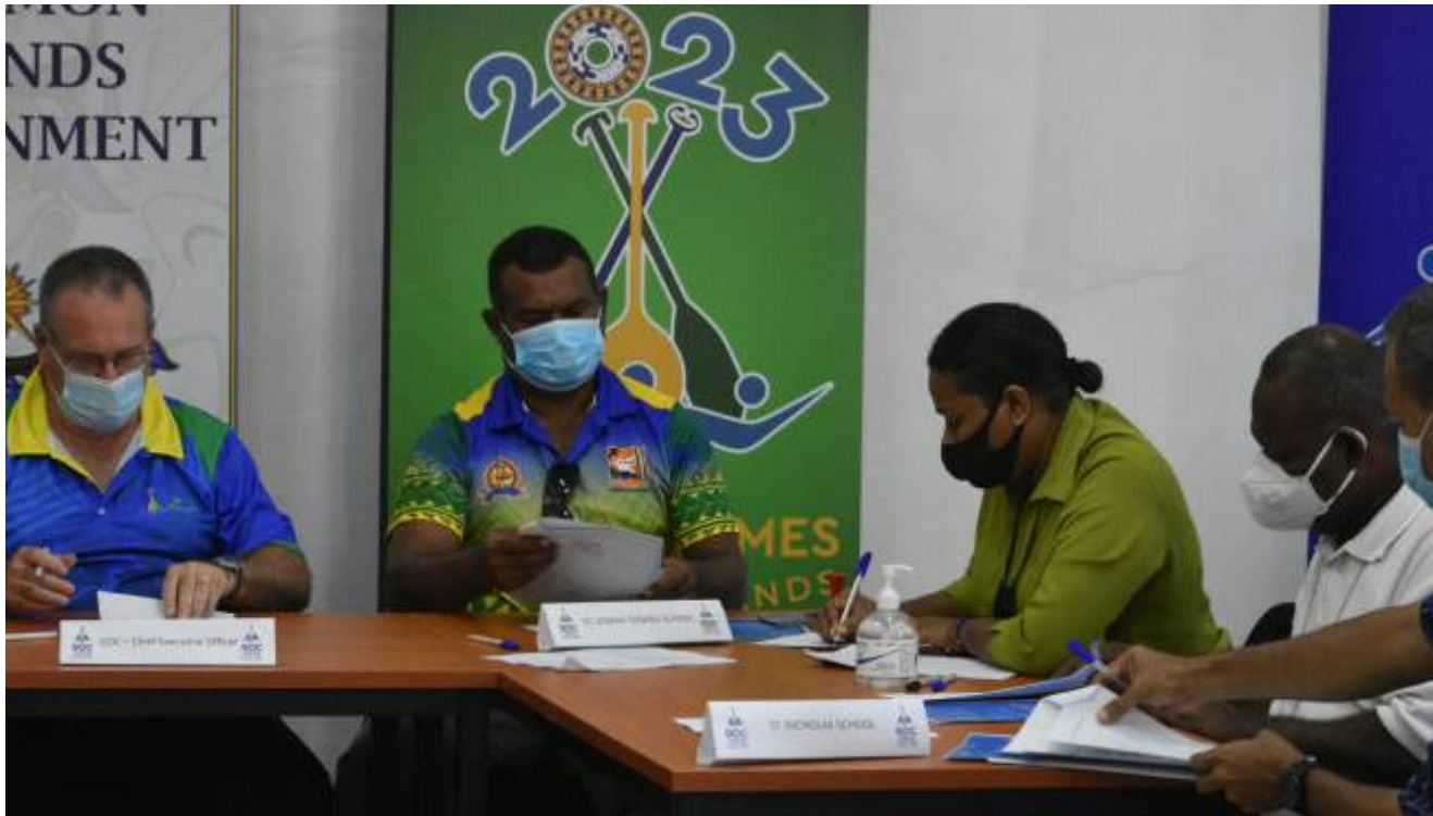
Venue Use Agreement signing with schools to become Games Villages in 2023.

The identified schools whose facilities will be used as venues for the Games Village are Solomon Islands National University (SINU) Kukum, Panatina and Marine campuses, KGVI, Tenaru, St Nicholas College and Don Bosco Institute (Henderson).