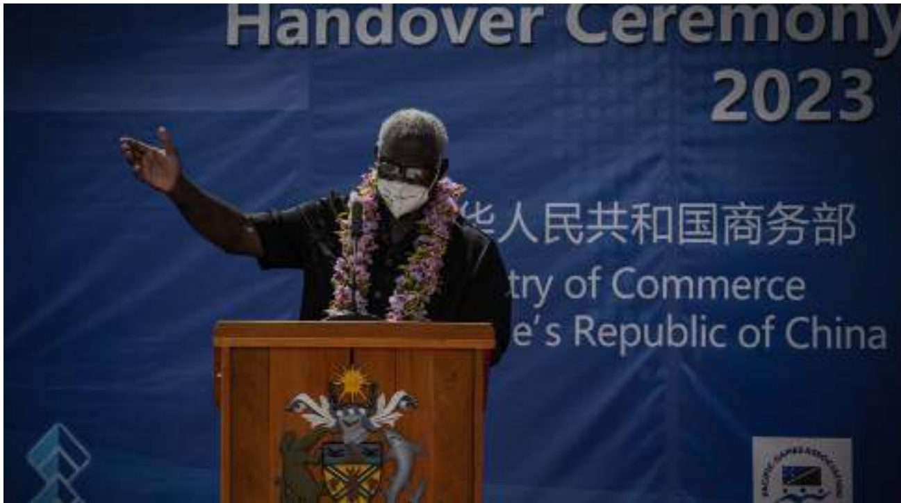
Solomon Islands Prime Minister, Hon Manasseh Sogavare reiterated that by June 2023 most of the facilities will be completed.

T ake a drive eastward in Honiara City today and you will witness the rapidly changing landscape of Solomon Islands' 'Sports City' for the 2023 Pacific Games.