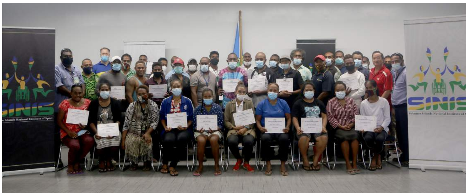
SINIS High-Performance launched its inaugural Coach Development Scholarship Program for over 32 coaches from different sports

On Monday 4th April 2022, the Solomon Islands National Institute of Sport (SINIS) High-Performance program launched its inaugural Coach Development Scholarship Program for 32 successful coaches across 15 different sports.