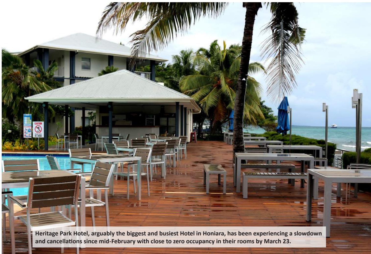
Heritage Park Hotel, arguably the biggest and busiest Hotel in Honiara, has been experiencing a slowdown and cancellations since mid-February with close to zero occupancy in their rooms by March 23.

Since its outbreak in China late last year, it has now spread to 184 countries and territories which has led to tourists cancelling trips globally including to tourism driven economies in the Pacific region.