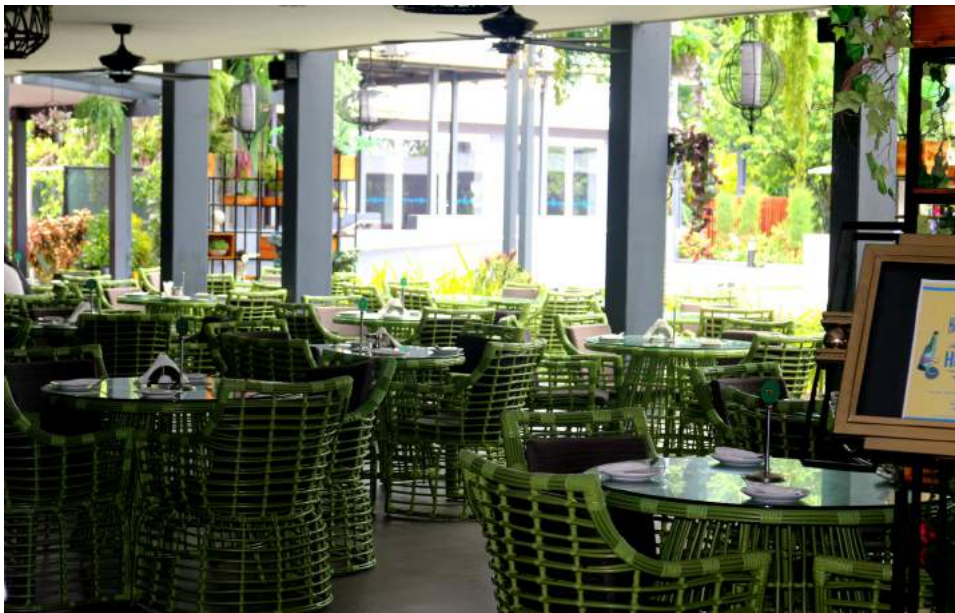
The usually busy Terrace Café at the Heritage Park Hotel on Monday 6th April.

Imperial Travel Service is a locally owned land transport and tours service, and