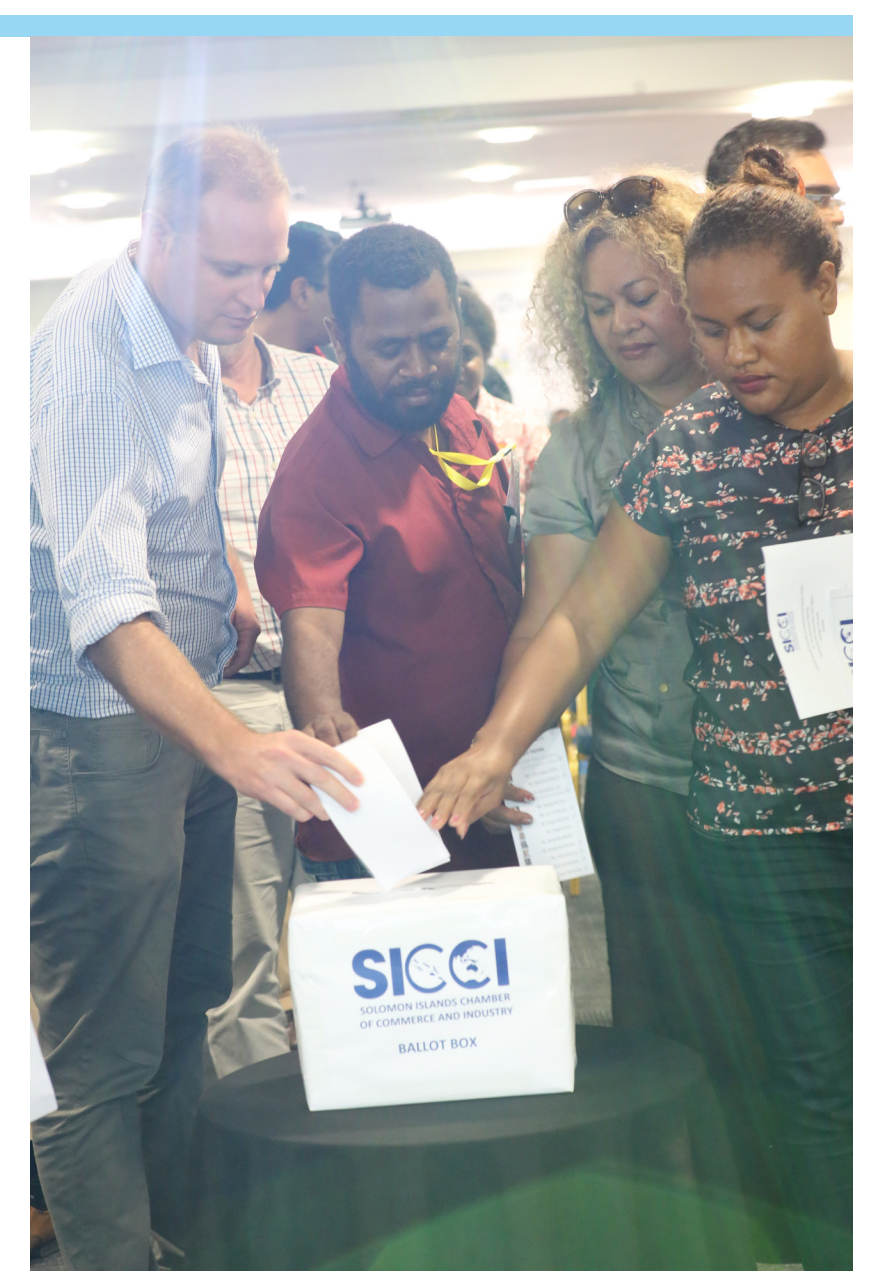
2018 Annual General Meeting (AGM) and election of new Board Members.