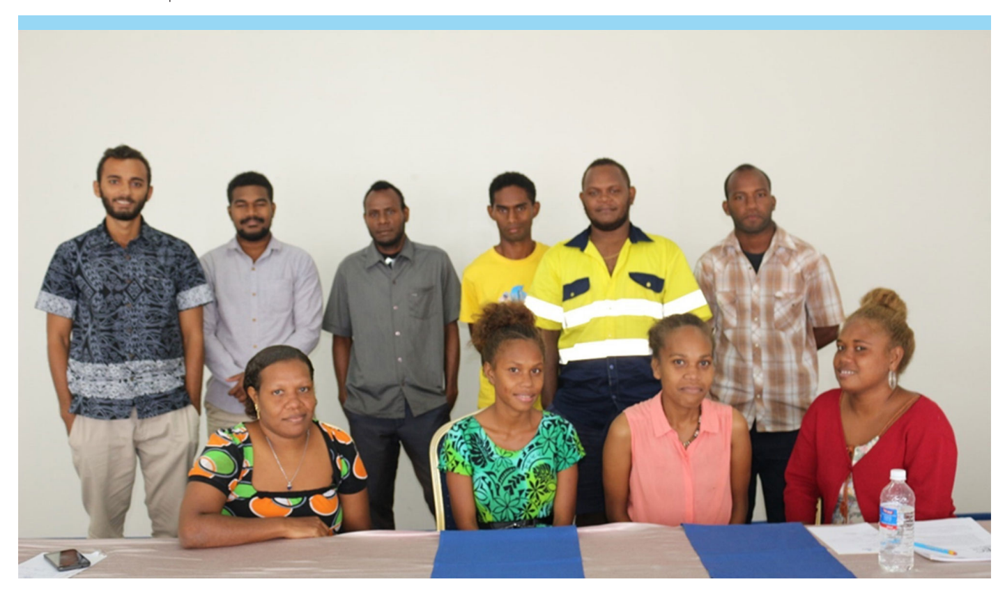
Before its launching, YECSI hosted a series of focus groups.