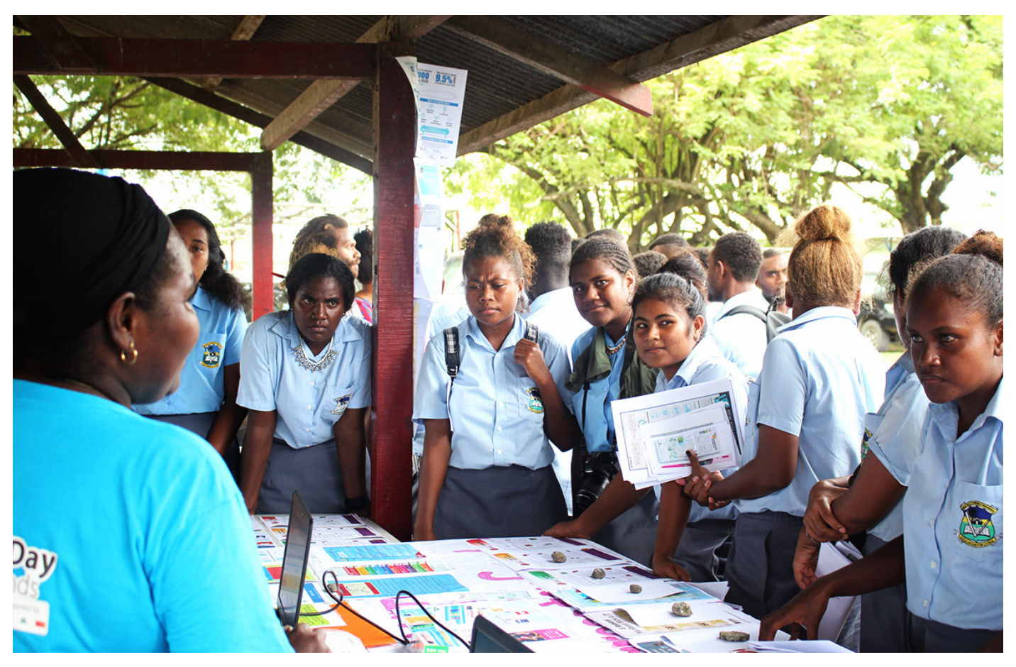
Students visitng business stalls exhibited at the Careers Market.