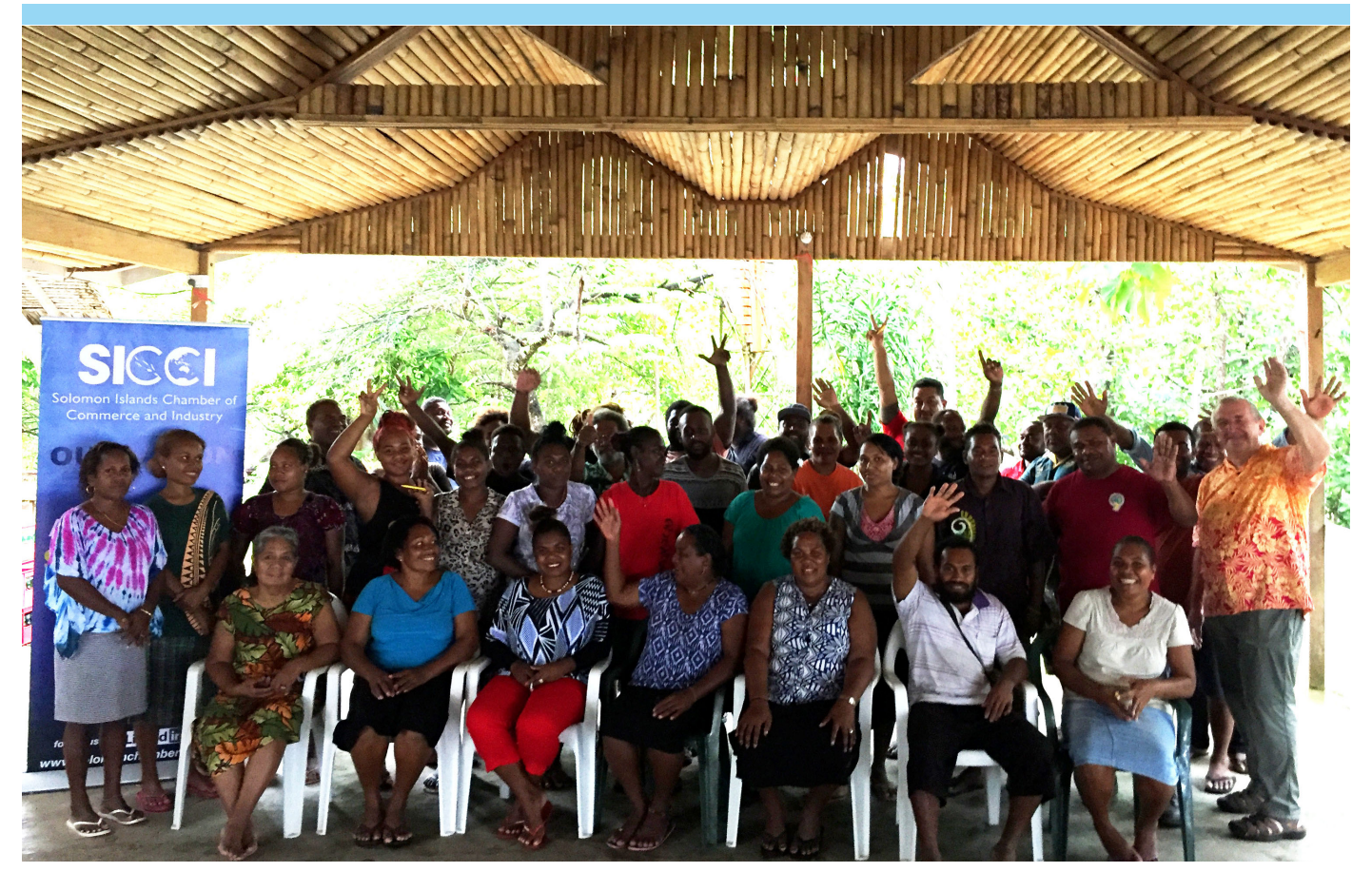
Participants of the two-day Auki roundtable.