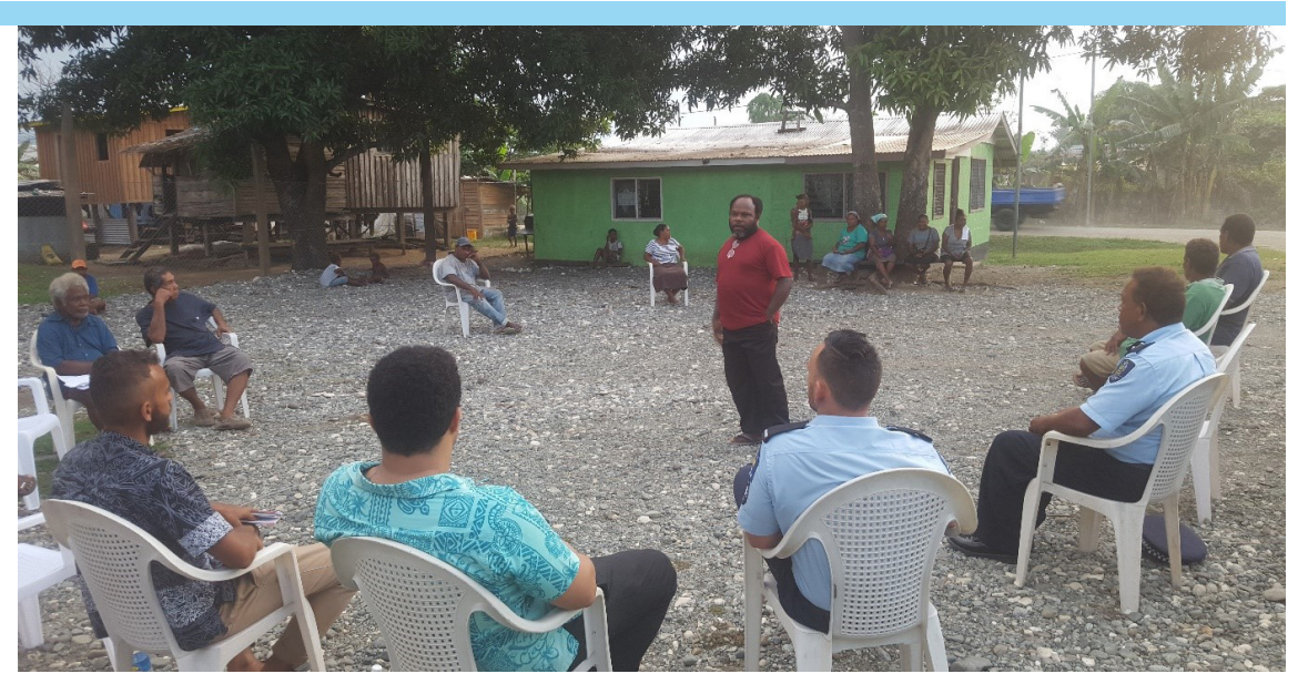
Burnscreek community consultation with community representatives on the social enterprise project.

allowing several members to give 3-minute pitches on their business to their peers. The event had high attendance of members with coverage from various media outlets, many of whom were surprised and amazed at the quality of the businesses pitching showing the huge potential in the Solomon Islands young entrepreneurs.