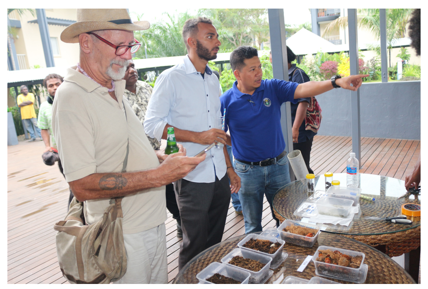
GPPOL hosted a BA5 on the Rhinoceros bettle.