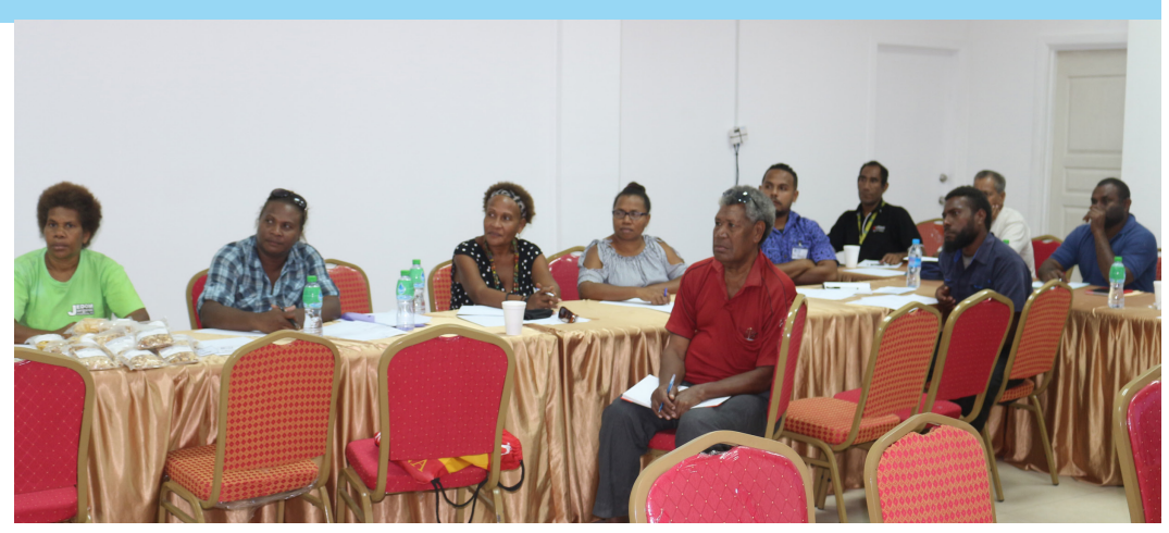
The two-day business training for SMEs in Honiara in 2018.

based on basic business needs and skills such as customer service and marketing. SICCI engaged Breadfruit Consulting to deliver the trainings.