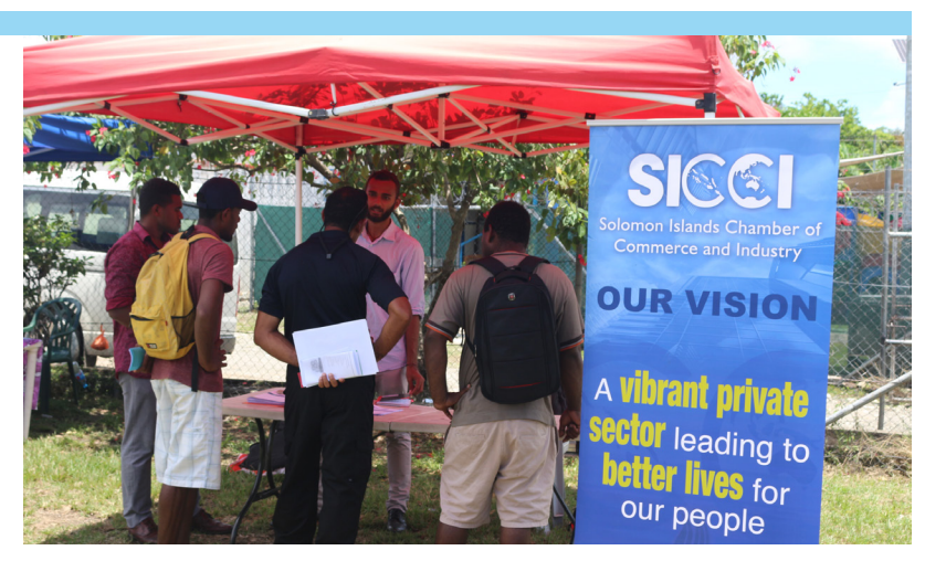
2018 RSIPF Open Day.