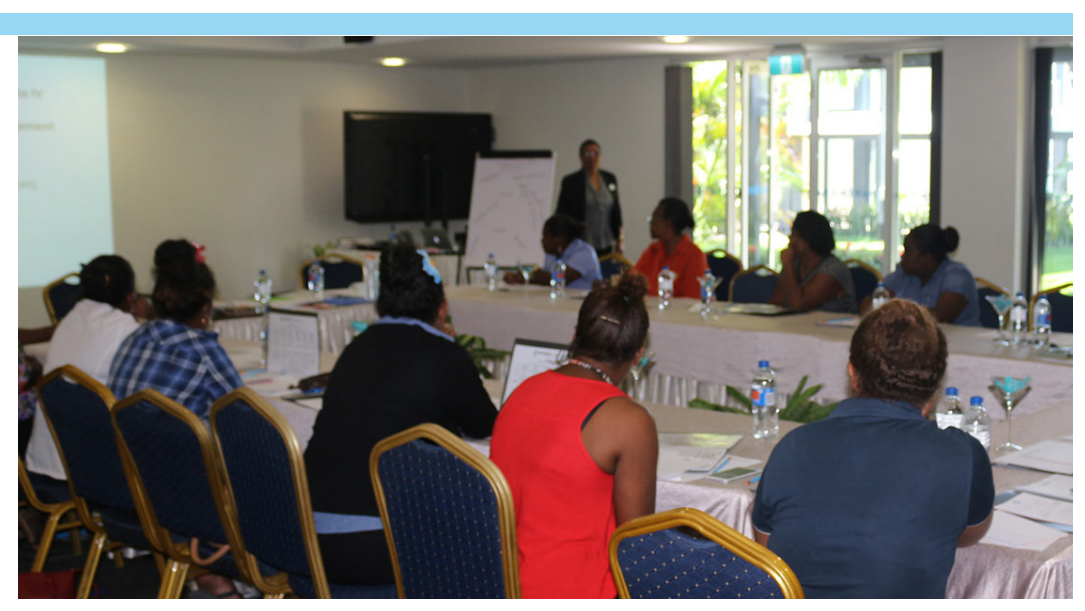
Women's leadership workshop.

Since its launch in July 2017, the program has focused its work on the three pillars. The first component of women in leadership is where companies were encouraged to conduct a gender assessment and set targets for increased numbers of women in management. The second component of ensuring safer workplaces for women saw the development of HR policies that encouraged respectful workplaces. The third component encouraged companies to set progressively-increasing targets and create opportunities for women into non-traditional jobs.