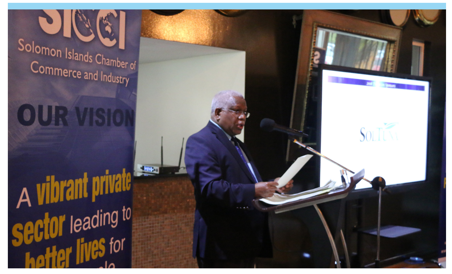
Prime Minister Hon Rick Houenipwela delivering his keynote address at the PM's Breakfast.