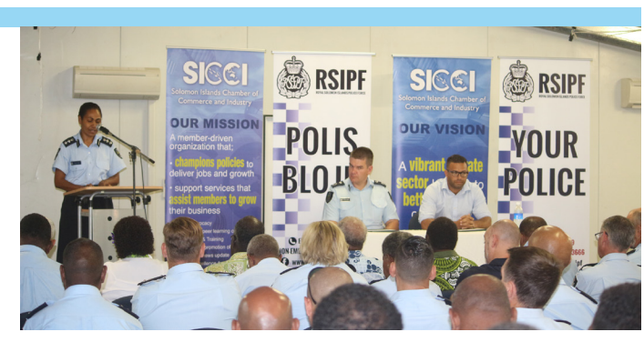
Signing of the MoU between RSIPF and SICCI.