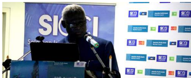
Prime Minister, Hon Manasseh Sogavare delivering his remarks at the Business Forum.

SICCI, as the peak body representing private sector, welcomes the progress