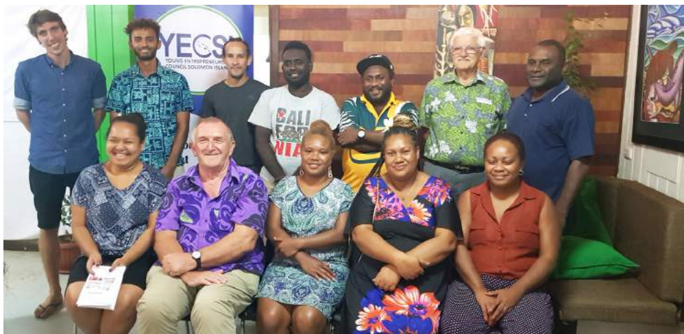
YECSI representatives and some of the Teachim Me program participants during YECSI's final ignite networking event on Thursday 31st November 2019.

To celebrate the closing of the mentoring program YECSI held its final Ignite Networking at the Lime Lounge Café