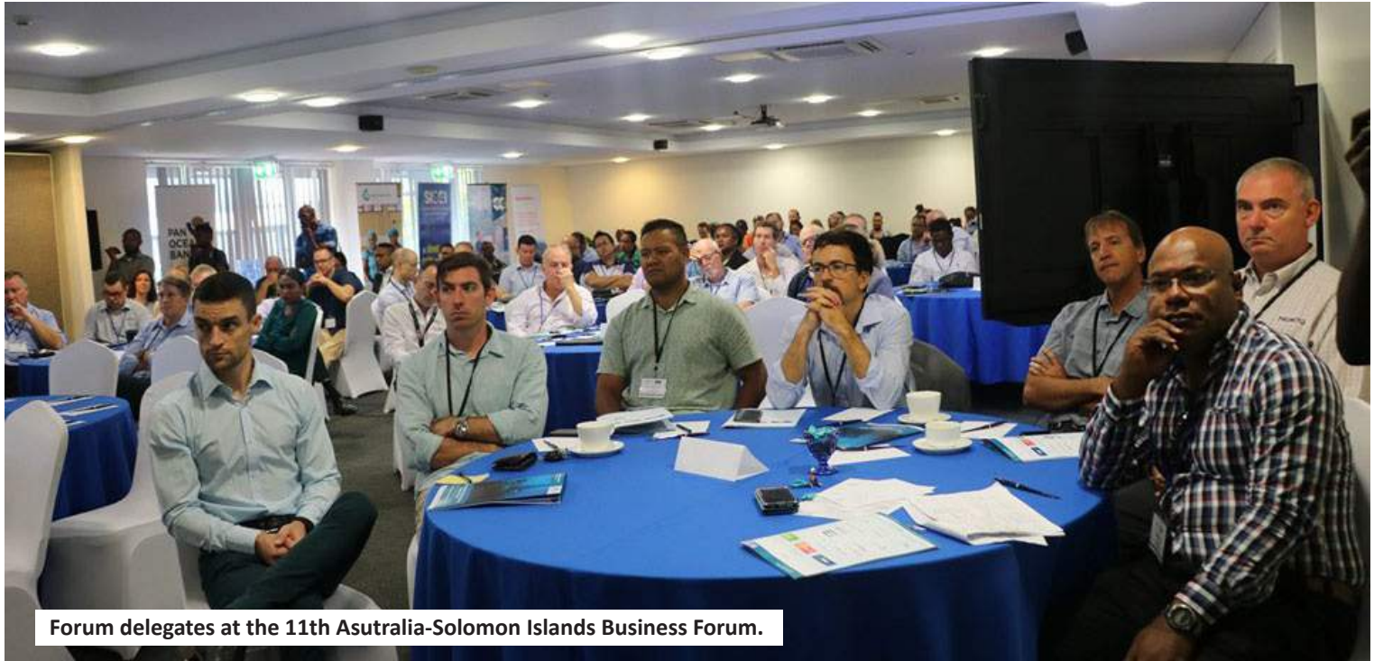
Forum delegates at the 11th Australia-Solomon Islands Business Forum.