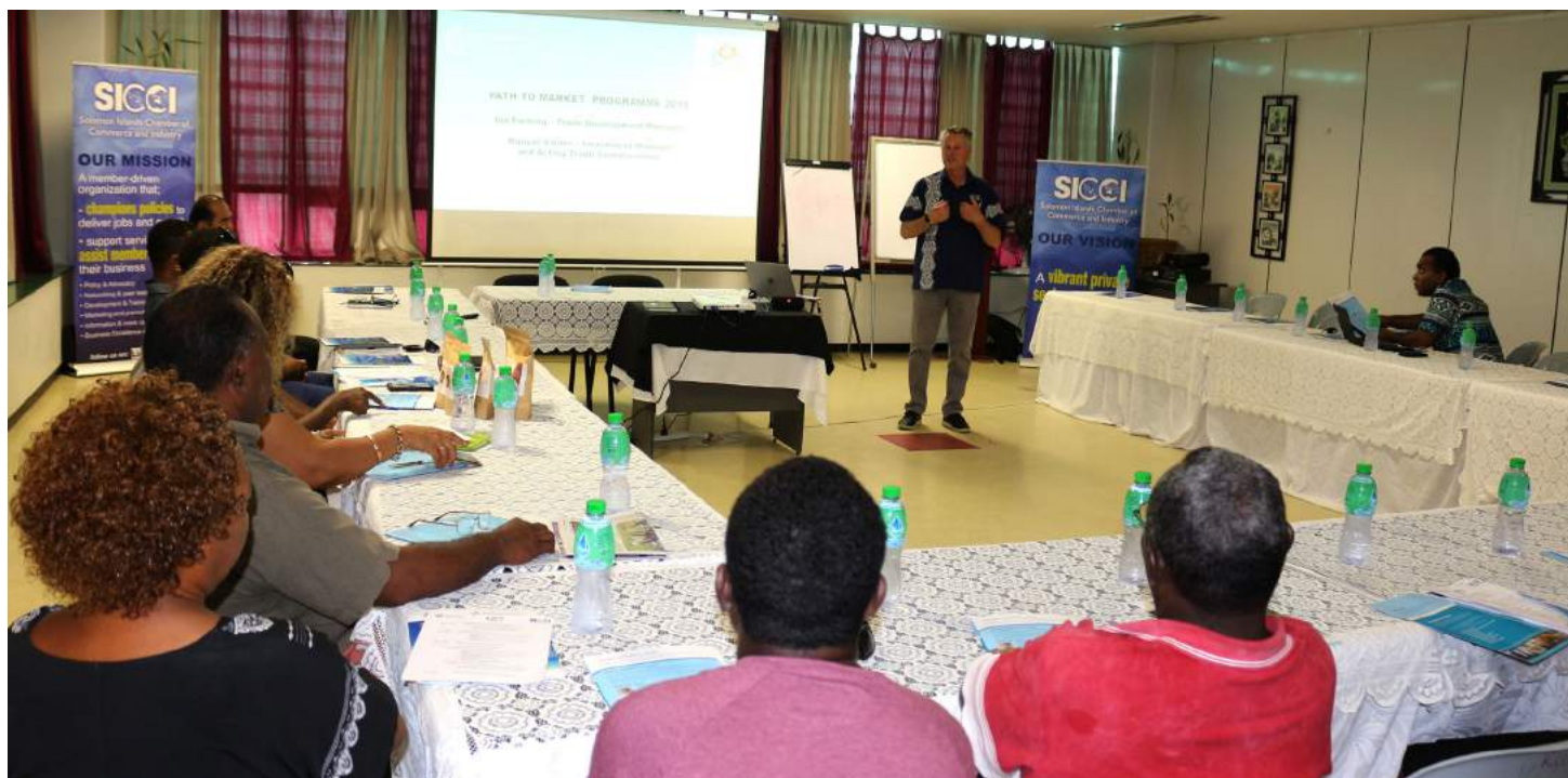
The free one-day workshop brought together thirty (30) participants ranging from local export ready businesses both SICCI members and non-members and Government representatives.