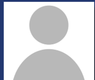
POSITION VACANT Export Industry Development Officer (EIDO)