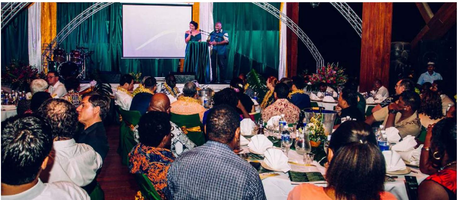
The Business Excellence Awards (BEA) is back for 2019 and promises to be the best yet . (Pictured) Guests at the 2017 BEA entertained by the event’s two hosts.

The 2019 Business Excellence Awards are proudly sponsored by: Solomon Islands Government, BRED Bank, Bank of South Pacific (BSP), Strongim Bisnis, Ricoh, Our Telekom, Coral Sea Resort, Kokonut Pacific (KPSI), Guadalcanal Travel Service, SATSOL, Solomon Star, TTV, Solbrew, SINPF, Island Sun, Millicent Designs, Sullivans, YECSI, Guadalcanal Plains Palm Oil (GPPOL), DJ Graphics, Ad Konect.