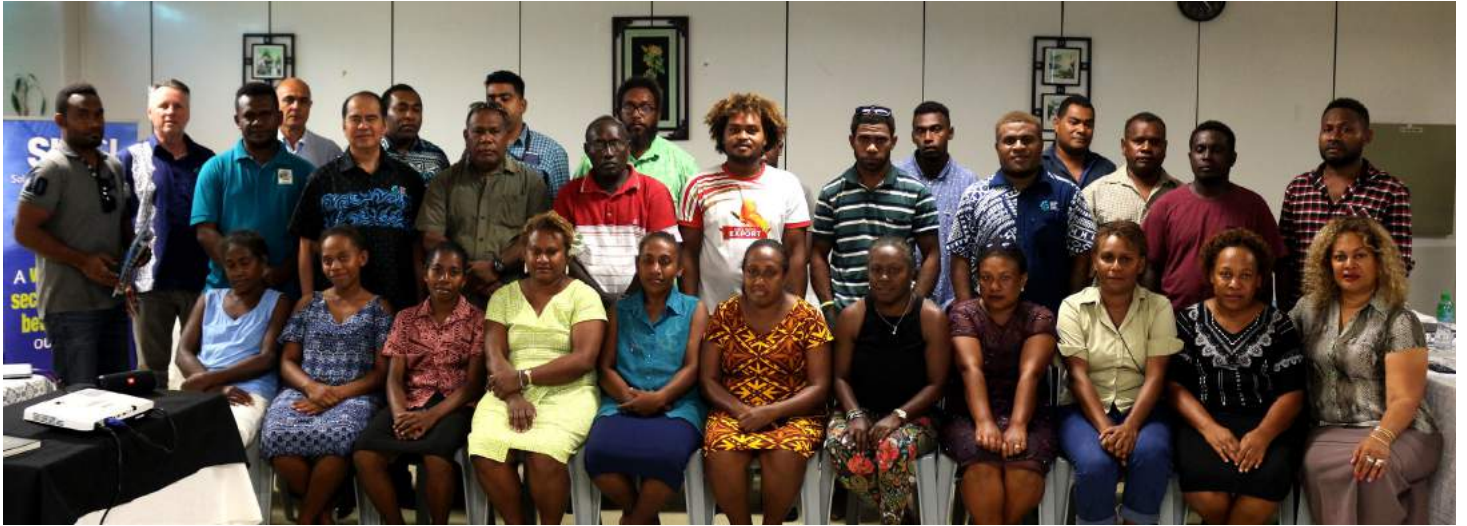
‘Business Capability and Investment’ workshop participants and representatives from Pacific Trade Invest New Zealand and SICCI.

Hosting such a workshop falls in line with SICCI's goal through its Export Industry Development Department on market-access related activities that will assist in export industry growth in Solomon Islands.