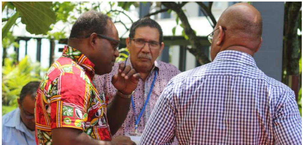
Minister for Infrastructure Development, Hon Manasseh Maelanga (left) having a quick conversation with SICCI members during tea break at the 11th Australia-Solomon Islands Business Forum.