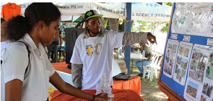
GPPOL's stall at the 2019 Careers Market.