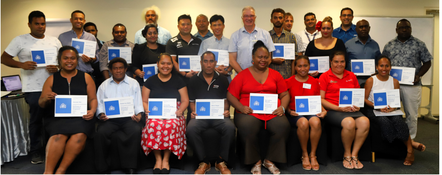
Participants of SICCI's third Directorship Programme with their certificates.

Tuesday 21 May, Honiara – As an organization that strives to achieve excellence in corporate governance, SICCI has delivered a third Essential to Directorship Programme in Honiara from 14-17 May 2019.