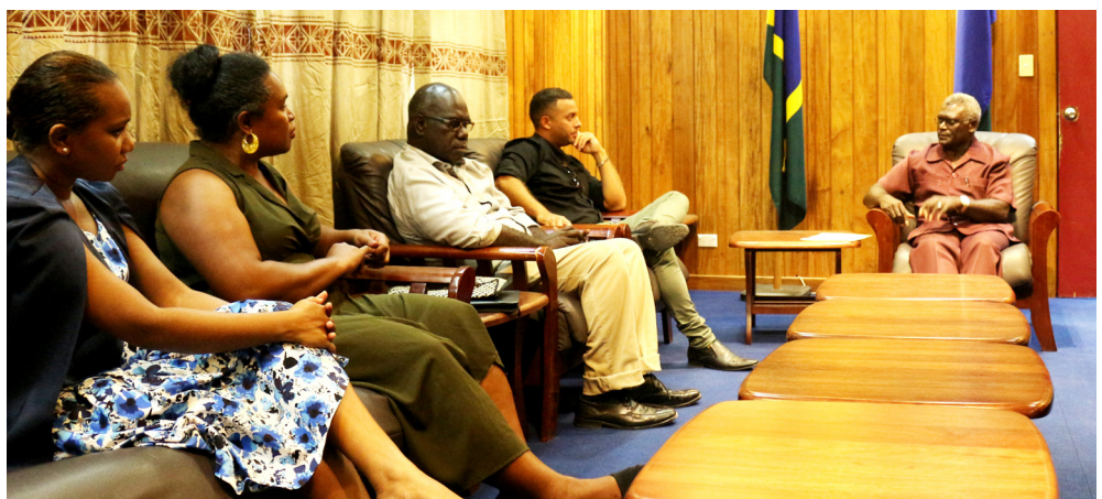
SICCI Board members and SICCI CEO during the courtesy call to the Prime Minister.

The courtesy visit was an opportunity for the SICCI Board to personally congratulate the Hon Prime Minister on his successful election, touch base on key private sector issues and assuring the Chamber's