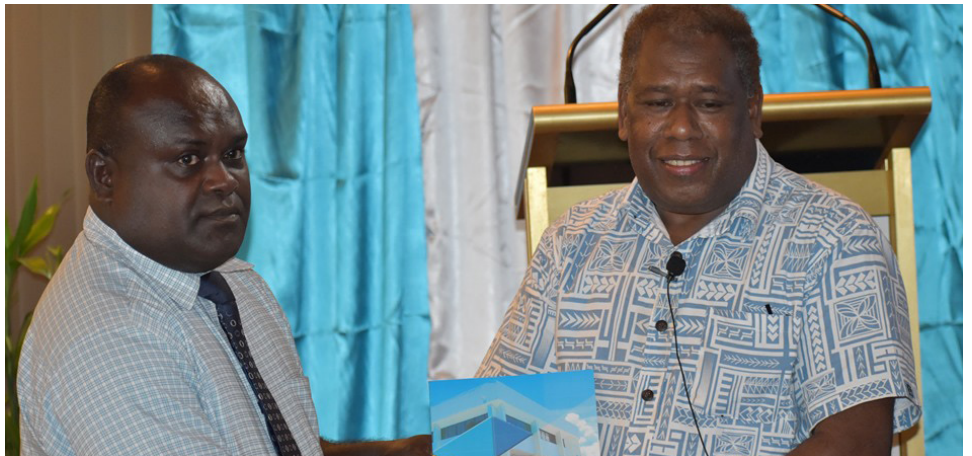
CBSI Governor, Denton Rarawa handover a copy of the CBSI 2018 Annual Report to the new Minister of Finance and Treasury, Hon Harry Kuma.

realistically grow the economy without overheating it, we should be growing at an average of 6% over the medium term.