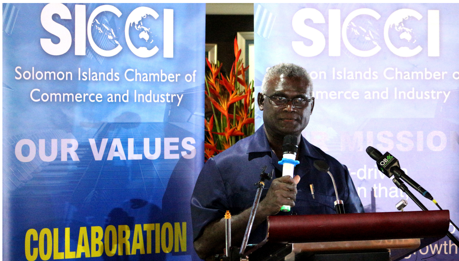
Prime Minister Hon Manasseh Sogavare addressing the business community during the 2019 PM's Business Breakfast and his Government's 100 days policy priorities launch in late May.

Friday 31 May, Honiara – Prime Minister Hon Manasseh Sogavare has commended the role SICCI is playing in representing private sector in the country and reaffirmed his Government's support towards private sector led growth.