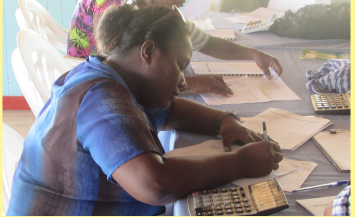
A business owner in Gizo, Western Province during the Bookkeeping and Basic Accounting training hosted by SICCI.

SICCI will be conducting two more provincial visits this year to Kirakira, Makira/Ulawa Province and to Munda and Noro in the Western province in July and early August.