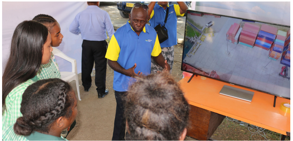
Students learning about the country's international port at the SIPA stall.