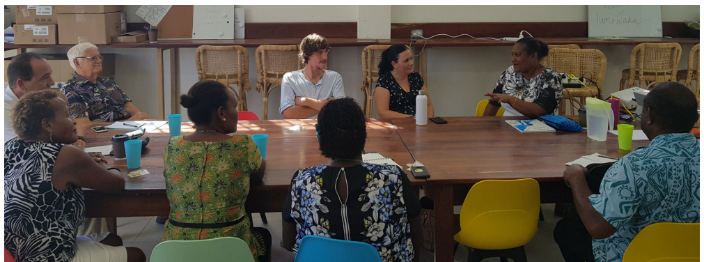
Group session for the nine mentees and mentors participating in YECSI's pilot Mentoring Programme.