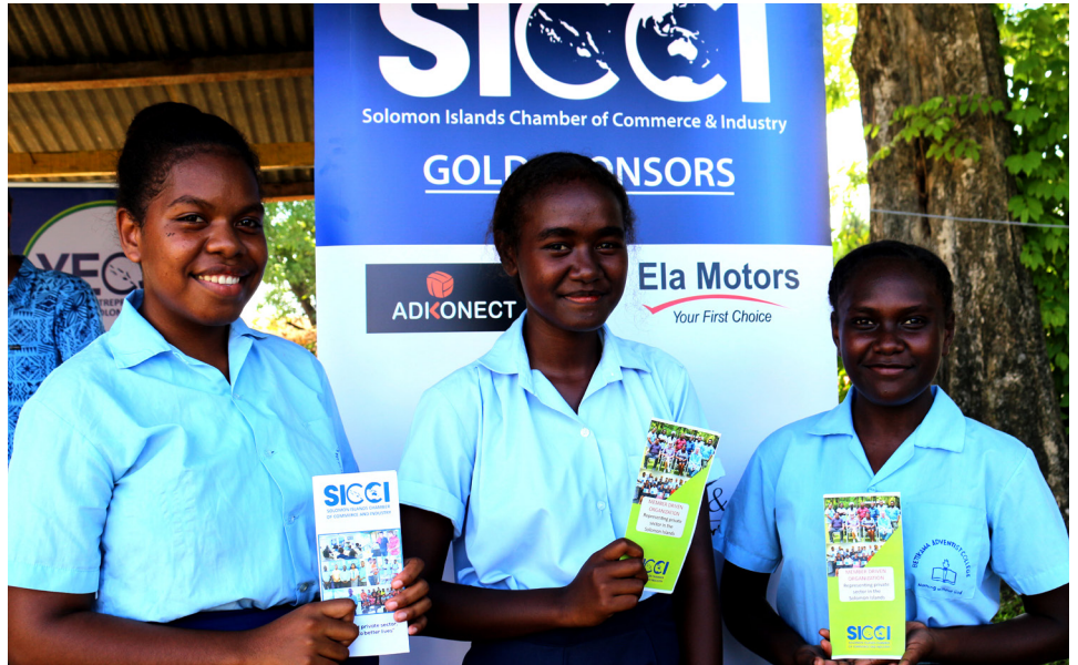
Students of Betikama Adventist College with their SICCI pamphlets.

It is the third such event since the inaugural Careers Market in 2017.