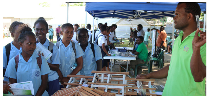
Ministry of Commerce providing information to students.