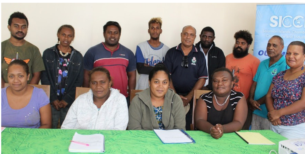
Business representatives who participated in the Booking and Basic Accounting training in Auki, Malaita Province from 25-28 June 2019.

The Careers Market held on 29 May 2019 saw more than twenty business