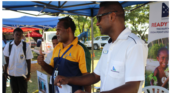
Solomon Airlines' stall was a popular one at the event.