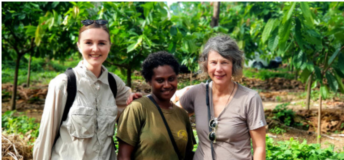
PHOTOS: Local cocoa farmers and international guests at the SolChocFestival also went on an exciting field trip to Blackpost, East Guadalcanal.

also promotes learning opportunities, good agricultural practices, value-added processes, and highlight the importance of cocoa quality for local farmers and buyers.