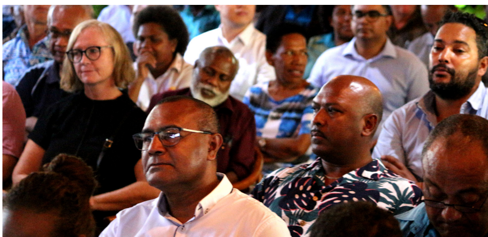
Members of the business community at the 2019 PM's Business Breakfast.

"I believe this is an important platform where the Government and the private sector are able to share views and ideas on the best possibilities to improve the lives